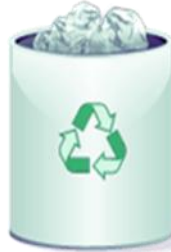
CDs and DVDs