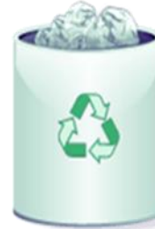
Cables and Wires